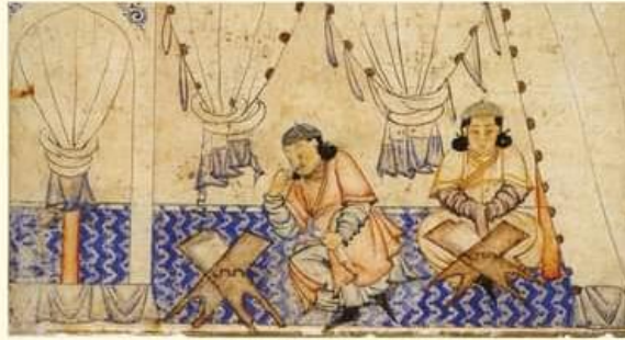
A Mongol prince studying the Koran.

Illustration of Rashid-ad-Din's Gami' at-tawarikh. Tabriz (7), 1st quarter of 14th century. Staatsbibliothek Berlin, Orientabteilung, Diez A fol. 70, p. 8 no.1.