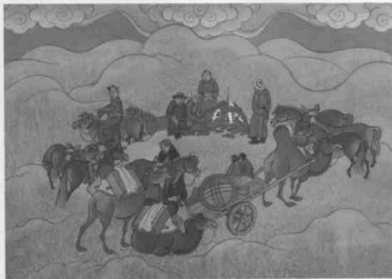
FIG. 6.3. A modern Mongolian painting showing circumambulation of the mountain cairn ( oboo ) by a nomadic group prior to making offerings. The skulls of favourite horses are placed on the oboo as a sign of respect for these animals.

my view, the oboo not only enacts the idea of the social group (a heaping-up of like things, stones, or branches), but is also the physical mark of the denial of horizontal space, a vertical statement. Just as the 'mountain' embodies the idea of height and hence of closeness to the sky, the oboo represents its peak. The ritual ( dallaga ) always involves circular movement, circumambulation of the site and the 'circular beckoning' of blessings from on high into sacrificial meat which is then shared and eaten.