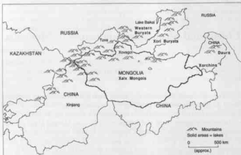
FIG. 6.1. Inner Asia.